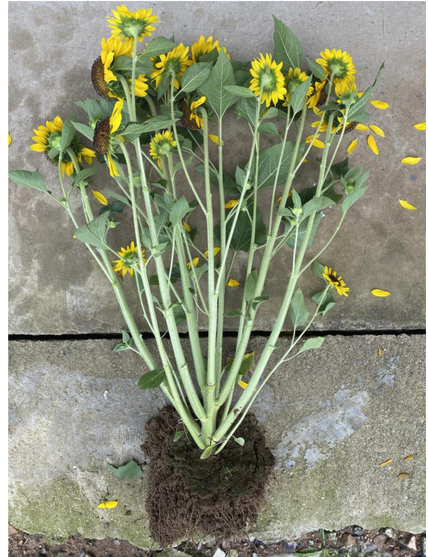
Pictured 40 days after pinching, 68 days after sowing