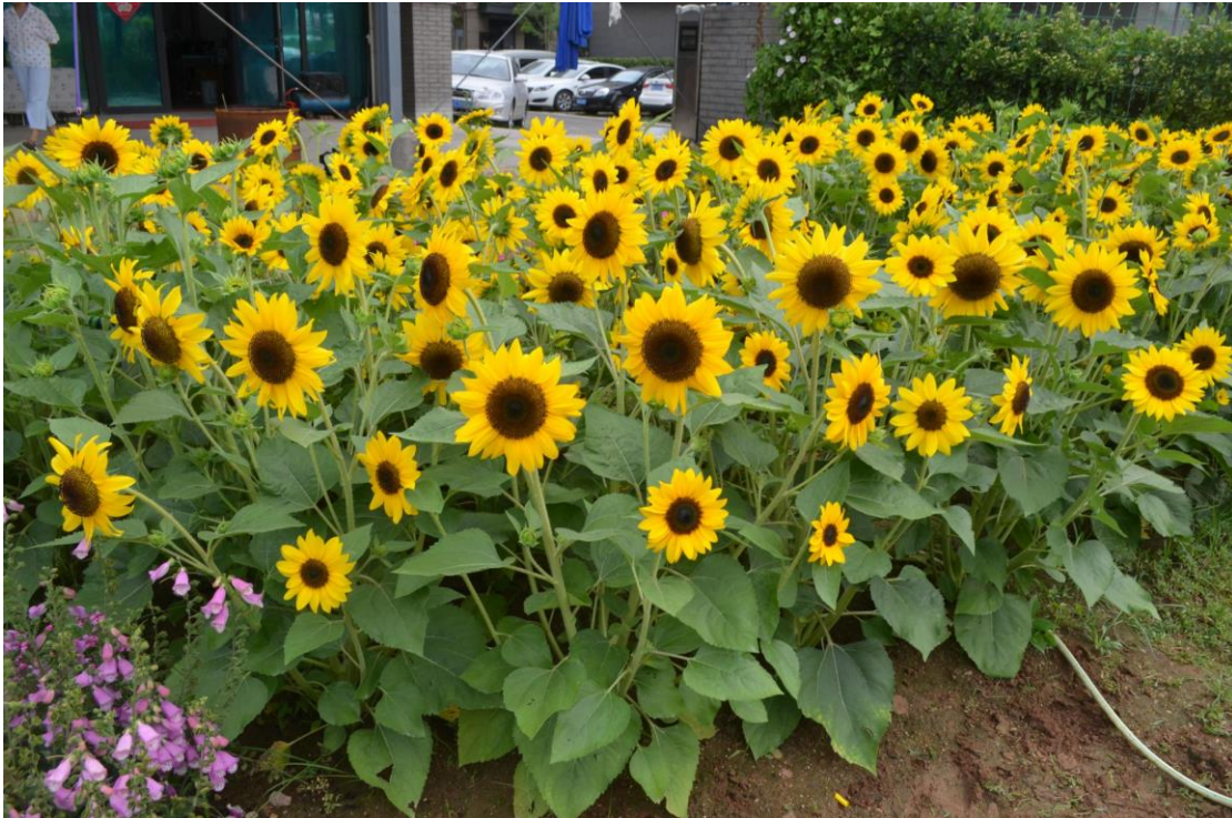
Pictured 28 days after pinching, 56 days after sowing